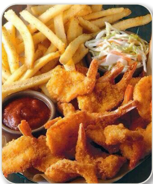
PLATE SHARING $2.50 EXTRA · MINIMUM CHARGE AT TABLES $2.50 PER PERSON · ALL ORDERS ARE AVAILABLE FOR TAKE-OUT 65¢ EXTRA PHOTOS ARE FOR SUGGESTIONS ONLY · ACTUAL PLATTERS MAY APPEAR DIFFERENT